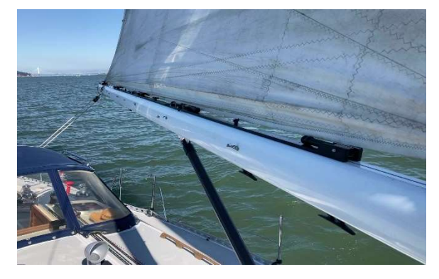
2 Zepp Sticks swung out in preparation for lowering the mainsail

Sailing with Zepp Sticks folded in stow position on boom, with Gathering Arms removed