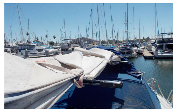
Gathering Arms removed and sail ties used to secure mainsail to boom. Zepp Sticks also provide a convenient platform for working on or folding and removing your good racing mainsail.

In marina, mainsail neatly flaked and ready for sail cover